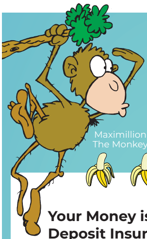
Maximillion The Monkey